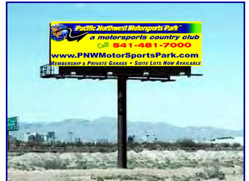
Billboard will be up on I-84 late this summer

A billboard announcing the location of the Pacific Northwest Motorsports Park will greet travelers on I-84 late this summer. The billboard will be placed near the Tower Road Exit (Exit 159) off-ramp on I-84 East. The billboard will stand approximately 40 feet off the ground and will be 48 feet long.