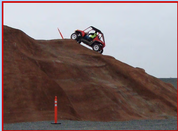
4x4 vehicles take on the off-road course

Being around the excitement of the races as well as new adventures for Miller made me even more excited as our opening date comes closer and closer. 2011 just can't come fast enough!!