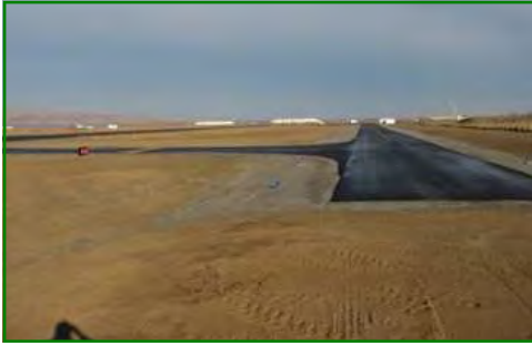
The new taxiway, facing East