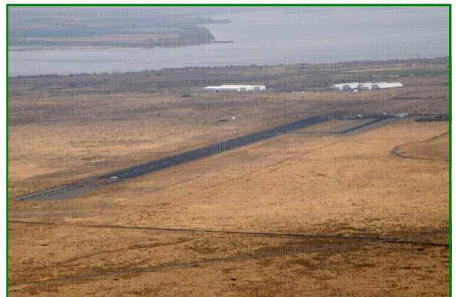
Arial View of the Boardman Airport Expansion

As part of the initial 2001-2002 hearings and decisions for establishment of a destination motorsports site, a 50-year airport master plan for expansion and/or including relocation options was required and approved by the FAA. Adoption of this plan into Morrow County land use code was also required as a precondition to our proceeding with development. We assisted the Port of Morrow and Morrow County Planning Department with this process and it was completed in April 2008.