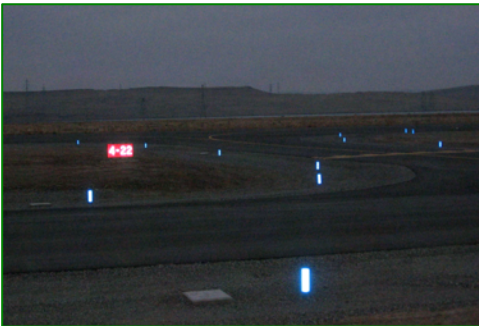
New taxiway to 4-22 hold line

The Port has begun to implement the approved expansion plan. A parallel taxiway adjacent to the East quarter of the runway with new directional marking, holding points and illuminators was completed September 30, 2008. Flying in to Pacific Northwest Motorsports Park is one of the best ways to see the overall site and the natural beauty of the area.