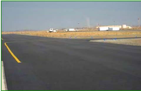
Approach to taxiway turn point